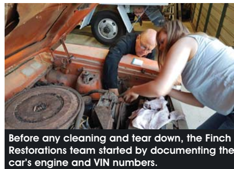
Before any cleaning and tear down, the Finch Restorations team started by documenting the car's engine and VIN numbers.

Established in 1965, Finch Restorations have a long history in repair, restoration and servicing of not only classic, but also