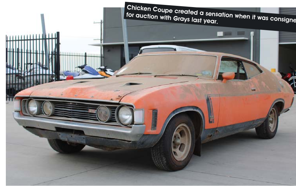
Chicken Coupe created a sensation when it was consigned for auction with Grays last year.

The first job for the Finch team was to confirm the car's ID and take a detailed look - inside, outside and underneath - before a thorough clean of the exterior.