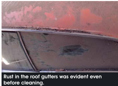
Rust in the roof gutters was evident even before cleaning.

This car was also heavily optioned from the factory, fitted with electric windows, power steering, intermittent wipers and tinted windows, while mag wheels, body stripes and orange fabric inserts on the white vinyl seats were added at the dealership.