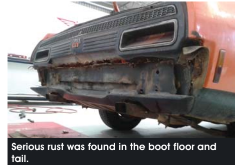
Serious rust was found in the boot floor and tail.